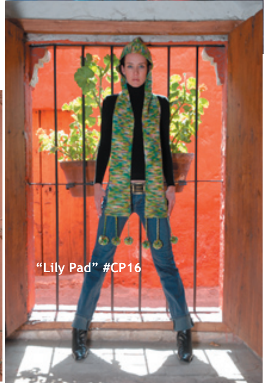
"Lily Pad" #CP16