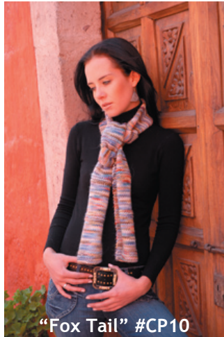
"Fox Tail" #CP10