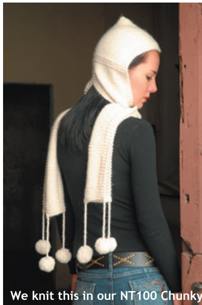
We knit this in our NT100 Chunky